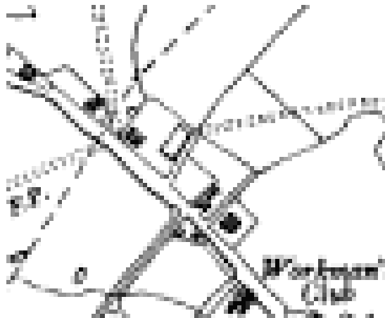
1961 OS map

3. In law a footpath must always start at the original 'Start Point'. A DM entry, DMMO or Diversion Order cannot lawfully change this Start Point.